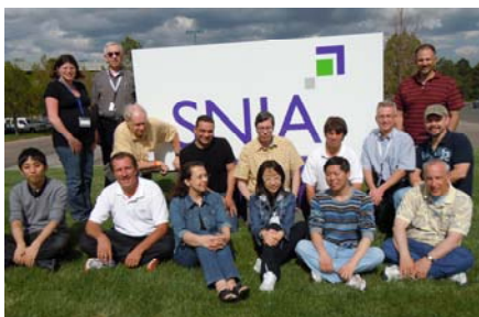
Attendees at the May 2010 Plugfest

Riding on the heels of the May Plugfest (#2), which saw SMI-S implementers addressing scalability and discovery issues, the SMI-Lab Program is moving full speed ahead. It is already promoting its agenda for the August plugfest (#3) and is finalizing key dates for the 2011 Program. Program participants have requested advanced planning, because they feel it will help them better prepare for plugfest activities and allow plenty of time for travel approval requests.