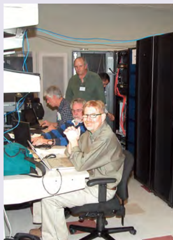
2008 marked the eighth year of operations for the SNIA Technology Center (U.S.).

The SNIA Technology Center (U.S.) in Colorado Springs successfully concluded its eighth year of operations with its busiest rate of utilization ever. Plugfests took place that supported SMI-S and its Conformance Testing Program (CTP), XAM, the Green TWG, as well as the Distributed Management Task Force (DMTF), SNIA's Alliance Partner. In addition to hosting other events, including SNIA Technical Symposia and end-user tours, the Tech Center hosted SNIA Certification training for more than 200 students. Renewing the promise and potential of this 15,000 square-foot facility, the Tech Center also hosted a large financial company that ran a networked storage proof-of-concept trial. With more than 825 visitors in 2008, the Tech Center continues to support SNIA technology and education efforts by hosting equipment for software development, research, and other projects.