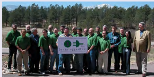
The GSI hosted its first-ever “Unplugged Fest” during Earth Day week.

SNIA’s Green Storage Initiative (GSI) is dedicated to advancing energy efficiency and conservation in all shared storage technologies, which will help minimize the environmental impact of data storage operations.