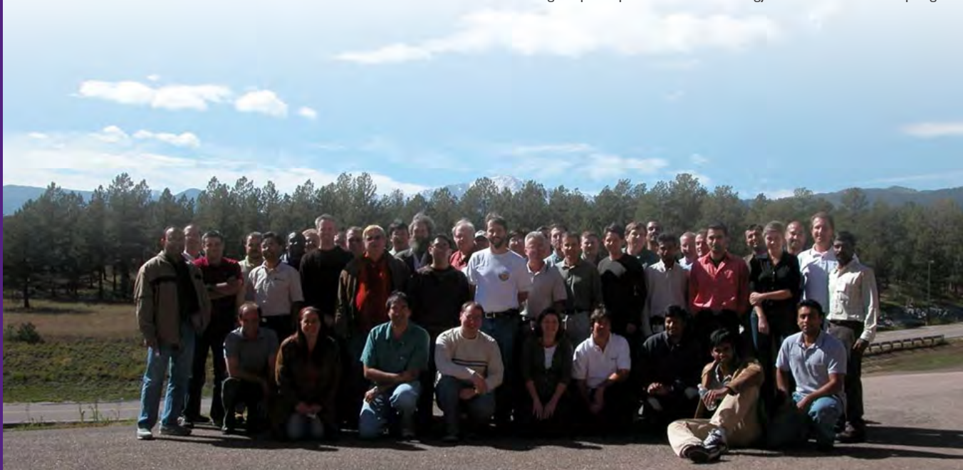
SNIA Plugfest participants at the Technology Center in Colorado Springs