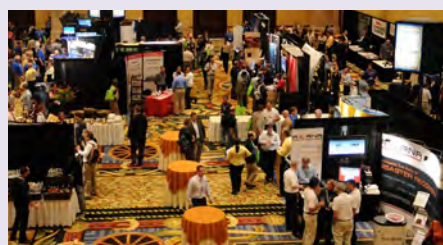
Co-owned by the SNIA and Computerworld, SNW continues to draw crowds as the world's premier storage event

SNIA Education continued to provide key leadership in the creation and delivery of hundreds of vendor-neutral, knowledge-based tutorials on networked storage and associated technologies in the popular SNIA Tutorials Program. Already a mainstay at SNW conferences in the US and in other geographies like SNW Europe, SNW China, SNW Japan, and SNW Australia, the SNIA Tutorial program experienced continued growth and success through extending and delivering these materials in other venues.