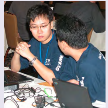
CIFS plugfest attendees discuss test results

The SNIA’s Technical Council and community play a key role in the only event created by the storage industry for those needing new or enhanced development skills, the Storage Developer Conference (SDC). In 2008, the event was once again a success, featuring more than 60 conference sessions on SNIA standards work and emerging trends in storage, with nearly 350 attendees participating in the event (presentations from SDC 2008 are available for download ). As an added feature, SDC 2008 included live Hands-On Lab for Developers (HOLD) sessions, as well as the traditional and well attended CIFS/SMB/SMB2 Plugfest.