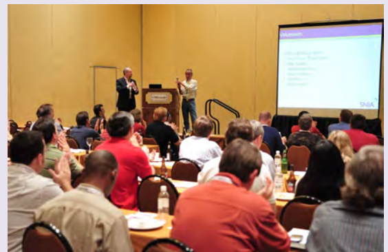
SNIA End User Council Town Hall Meeting at SNW Fall 2008

In 2008, the EUC launched StorTOC (Storage Technology Online Community). Providing a vendor-free venue where storage end users can network on a daily basis – locally or internationally – StorTOC is a portal where end users set the agenda to define best practices, further technical and leadership skills, and find opportunities for larger collaboration with industry on key initiatives.