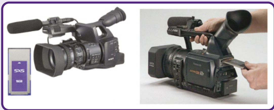
Figure 2. Sony and Panasonic professional video cameras using flash storage

professional mobile video cameras. Most of these flash-based video cameras use proprietary flash card formats. Figure 2 shows a couple of professional HD cameras using flash storage.