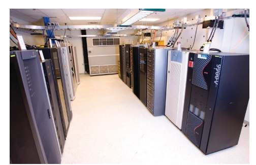
Data storage at the new SNIA Technology Center in Colorado Springs.

In 2009, SNIA published its first SNIA Member-approved SNIA Software, NDMPv4 Release I.O. This software implements version 4.0 of the Network Data Management Protocol (NDMP) standard. NDMP addresses the challenges associated with backing up multi-vendor network attached storage systems. The SNIA software will help accelerate the already widespread adoption of the NDMP standard by storage vendors and IT users in all markets worldwide by assisting their implementation of NDMP v4.