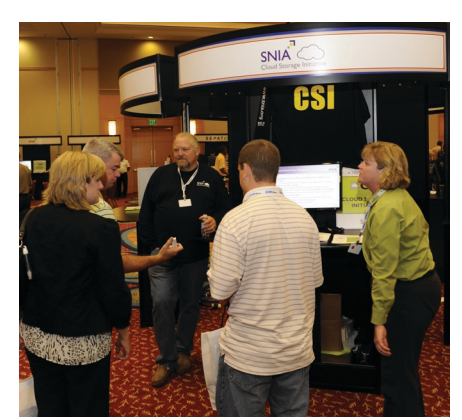
CSI showcased their new initiative in a pavilion

In October 2009, the SNIA announced the formation of the Cloud Storage Initiative (CSI) with the purpose of fostering the growth and success of the market for Cloud Storage. In addition to coordinating all Cloud-related activities in SNIA, CSI is responsible for managing many cloud-related programs including those for education, marketing, technical coordination with the Cloud Storage TWG, business developments, cloud standards cross-industry efforts. The CSI will also collaborate with the Cloud Storage TWG on CDMI reference implementations, and conformance testing.