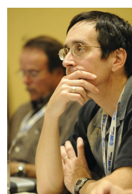
Over 4000 people attended SNIA Tutorials at SNW in 2009

These valuable resources are used worldwide by technical staff, resellers, analysts, journalists, end users and vendors, and in part, can be a tool in the training of new employees. They are the primary resource for the SNIA Tutorial booklets and are one of the resources used as a reference for SNIA Certification exams.