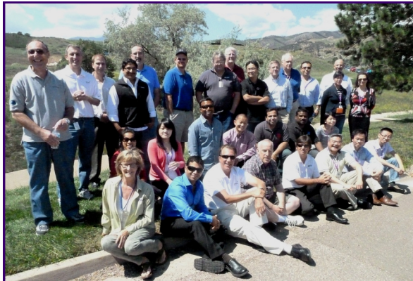
A great turn-out and beautiful weather in Colorado!

On August 19-22, 2013, the SMI-Lab held its fourth plugfest of the year at the SNIA Technology Center in Colorado Springs, with over 30 attendees from 14 companies.