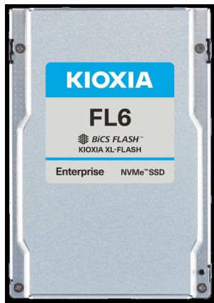
Illustration: Low Latency SSD Drive - FL Series SSD, with XL-FLASH™ memory, in a 2.5" 15mm Z-height form factor.

Typical features found in NVMe SSDs in enterprise storage environments are dual-port (2.5-inch form factor), predictable low latency, and very high endurance.